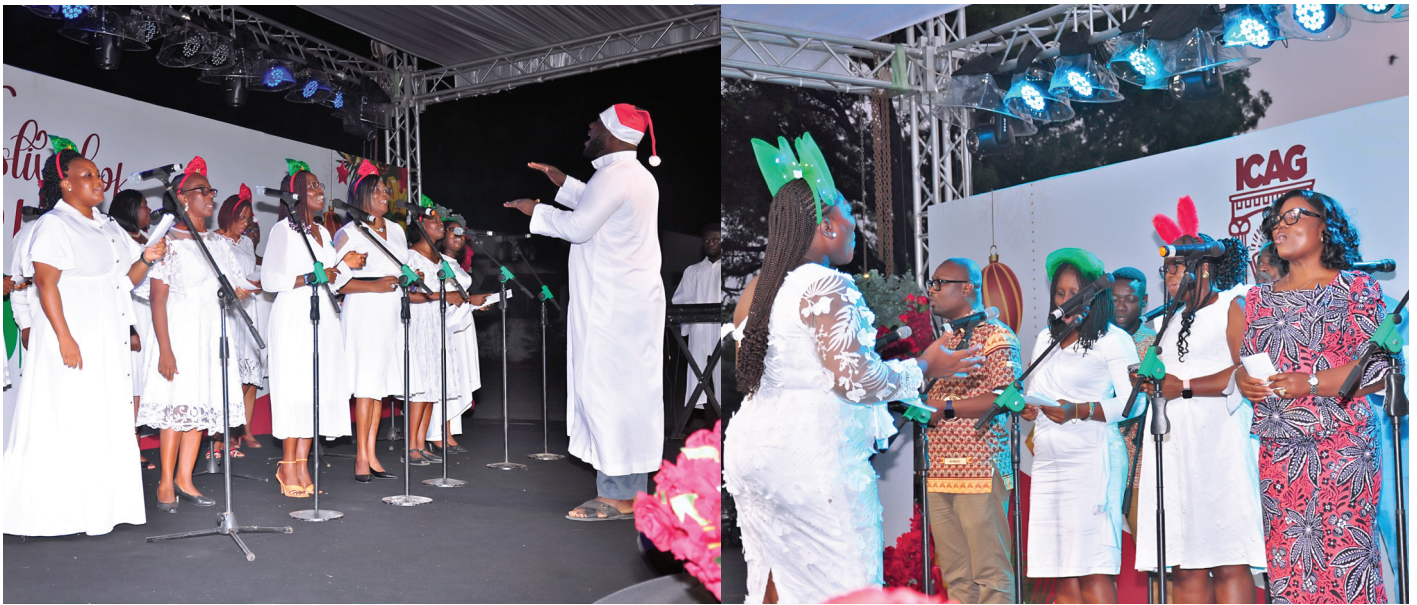
A cross-session of District Societies performing their carols on stage