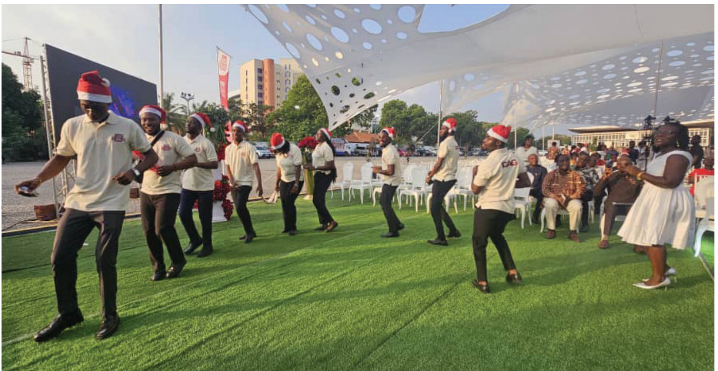
Some National Service personnel of the Institute at on the dance floor