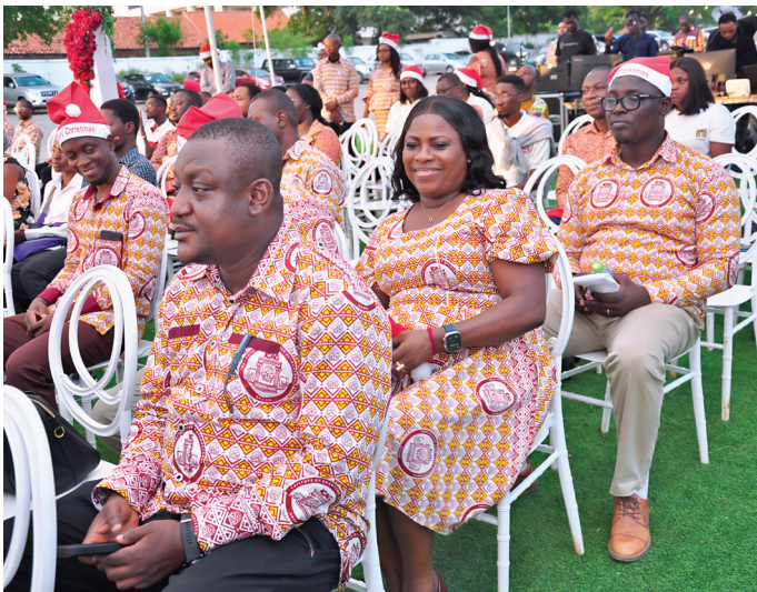
A cross-section of ICAG staff at the service