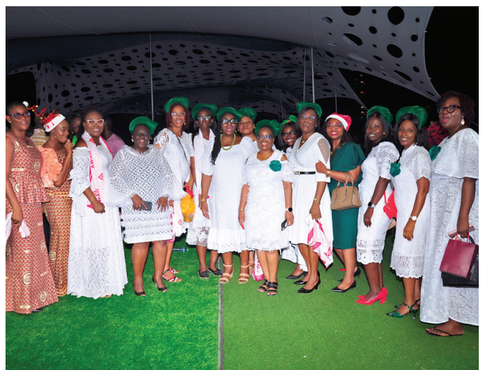
AWAG members in a group photograph