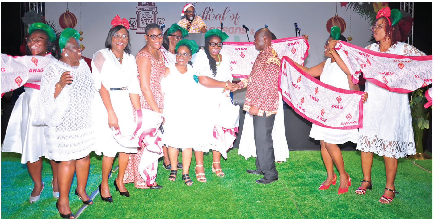
AWAG members receiving their award for emerging winners of the carols signing competition