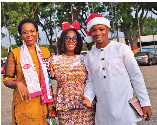
A group photograph of some members of the Institute