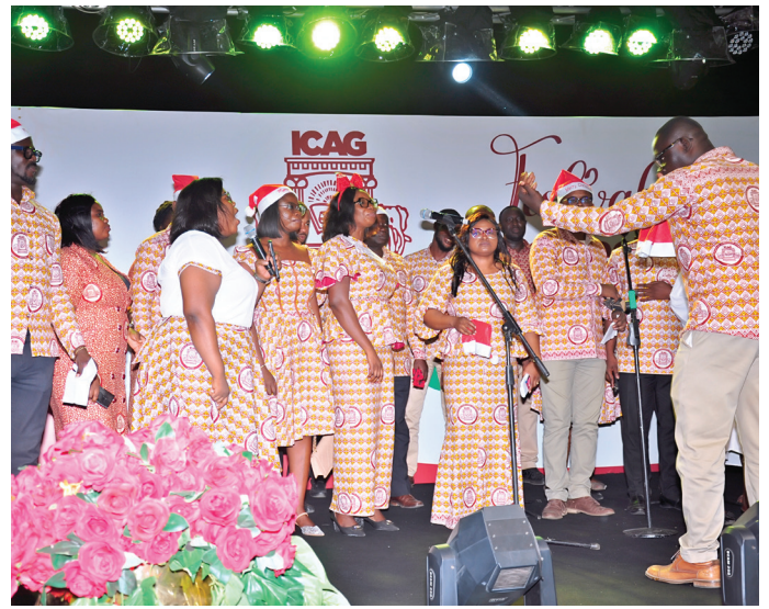
ICAG staff performing a carol on stage