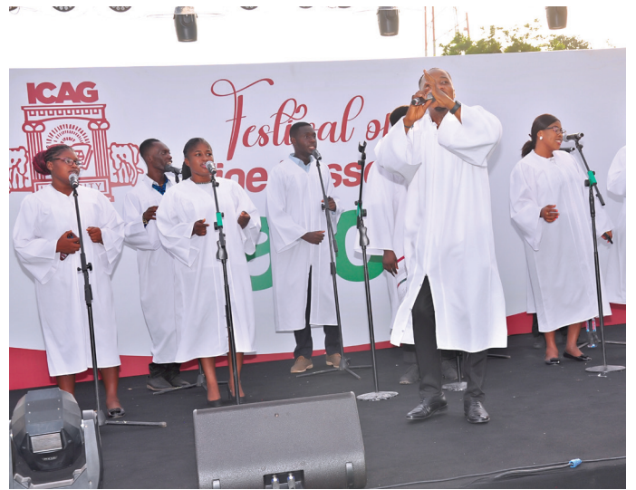
Tema Choral Choir leading the praise and worship session with melodious songs