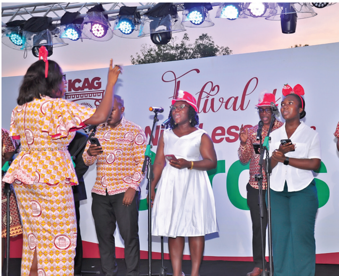
Representatives of Accra West District Society performing their carol on stage