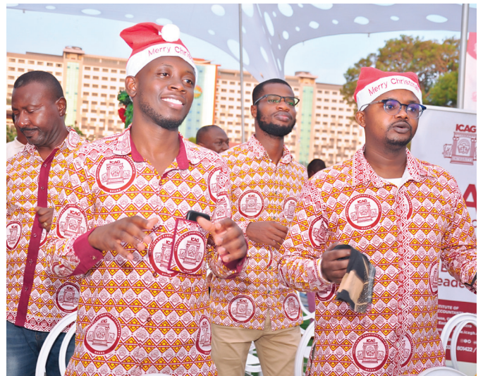
Some ICAG staff dancing