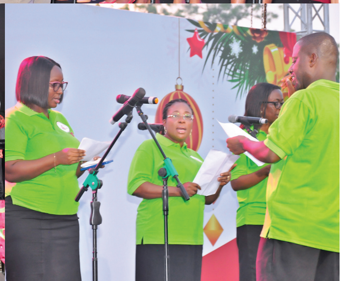
A cross-section of District Societies performing their carols on stage