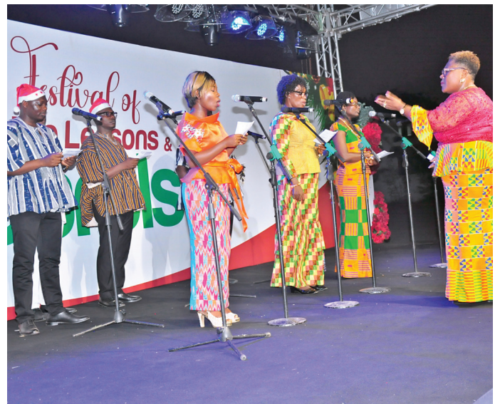
Representatives of Kasoa District Society performing on stage in their beautiful traditional attire