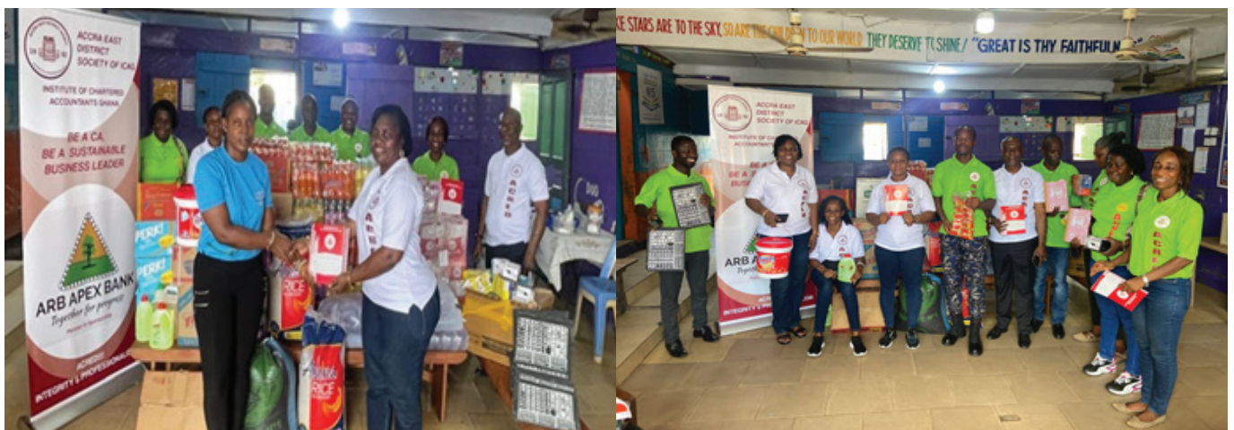
Representatives of Accra East District Society (AEDS) presenting items to the School

The Founder of the School, which started operating in 2019, thanked the Society for their support. "These items will last us for the entire term and we are very grateful for the support", she said. She further called on corporate Ghana and other benevolent institutions to support the Genesis Shishedzee to help make a positive impact on the lives of the children, who pay no fees to attend the school.