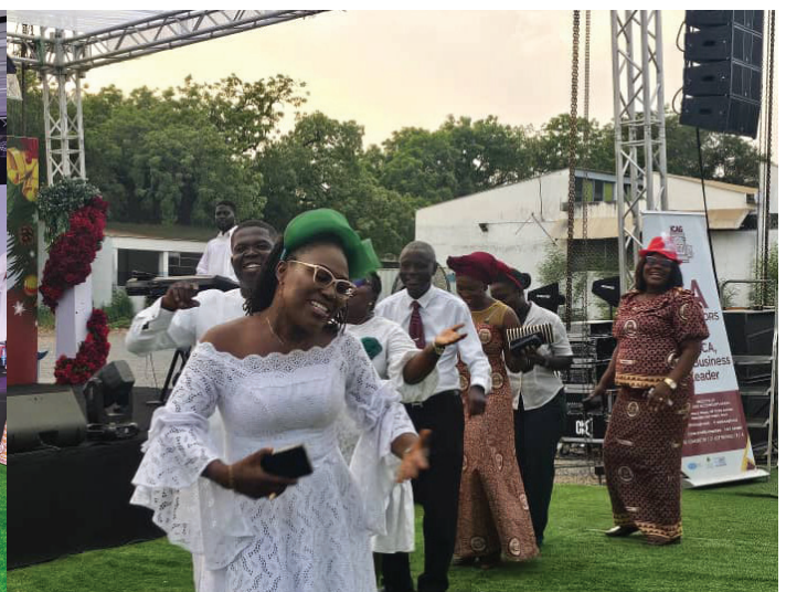
Some members on the dance floor